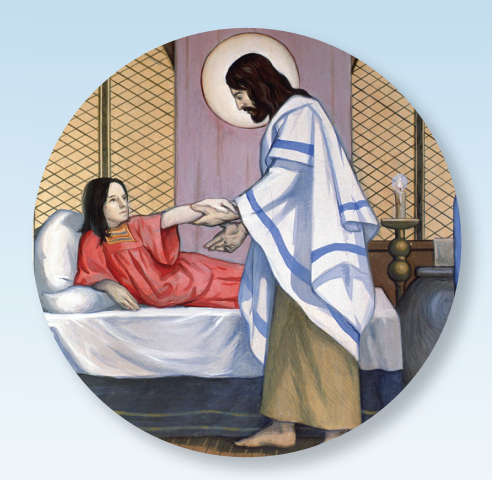
Jesus raising Jairus's daughter

Jesus' touch healed people and brought them life and peace. The sacraments celebrate Jesus' presence among us today. A sacrament is a sign by which Jesus shares God's life and blessings—his grace—with us.