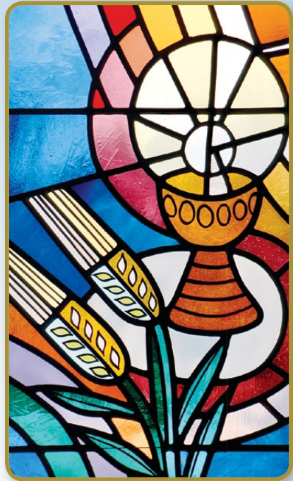
Stained glass window, St. Jerome's Church, Minnesota

Jesus encouraged his followers to be aware of the presence of God in their lives and pray to stay close to him. One way for us to do this is by receiving the Eucharist frequently.