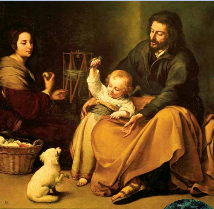
The Holy Family with Sparrow, Bartolomeo Esteban Murillo