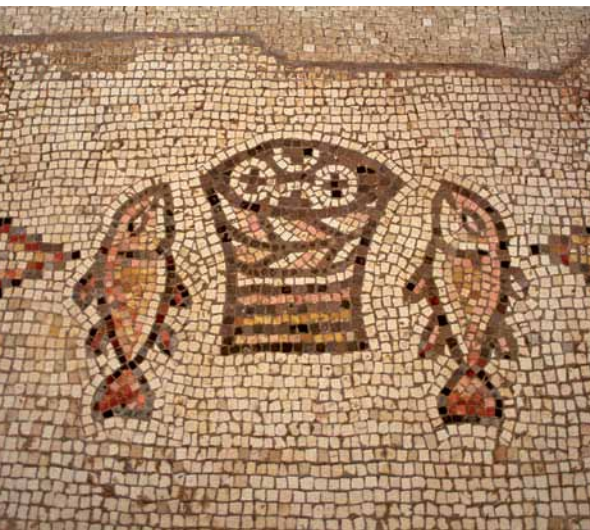
Byzantine Mosaic, Church of the Multiplication of the Loaves and Fishes