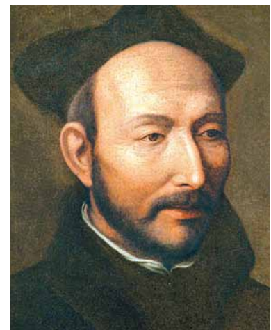
Portrait of Saint Ignatius, Jacopino del Conte

In 1975 Jesuits from all over the world met and discussed their goals. They decided then that any ministry with the name Jesuit attached to it should serve others and promote justice. Jesuits in the United States directly engage the social problems of today as prison chaplains, community organizers, and lawyers, working for the rights of the poor and marginalized.